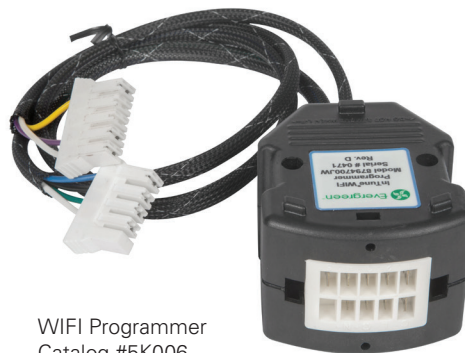
WiFi Programmer Catalog #5K006

Anyone can install a motor, professional contractors follow industry best practices by measuring airflow and adjusting motor operation for proper performance, efficiency and customer satisfaction.